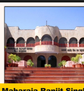
Maharaja Ranjit Singh Museum